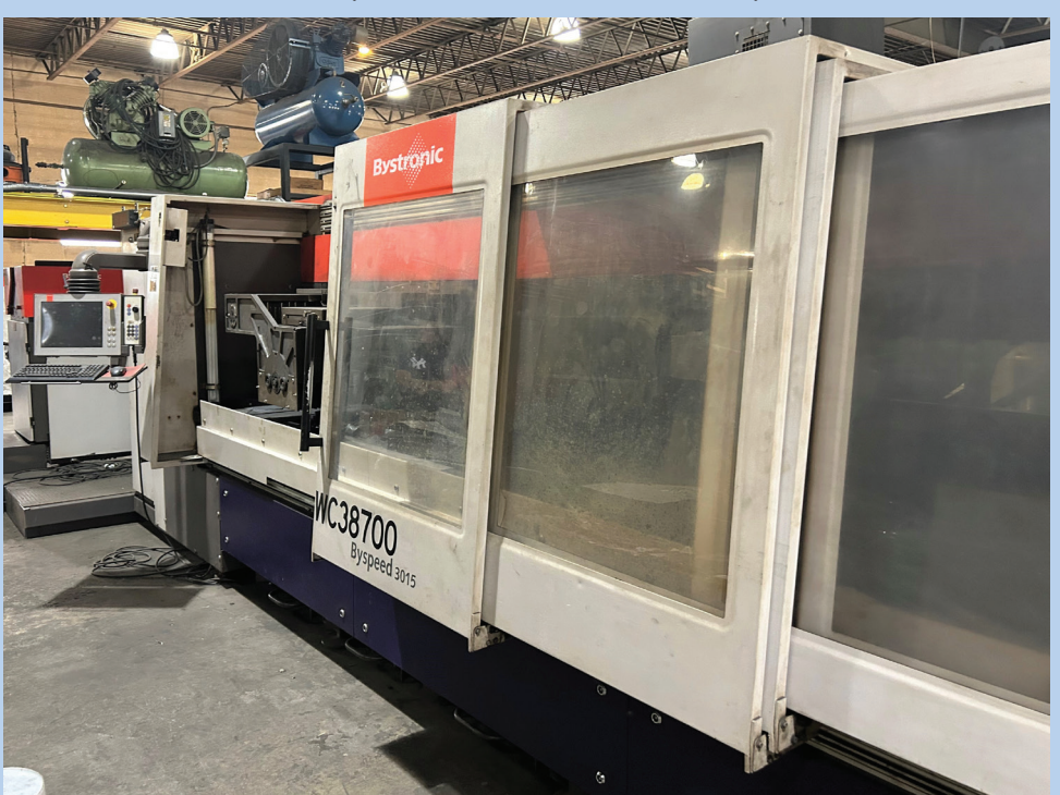
Bystronic Byspeed 3015 CNC Laser Machine