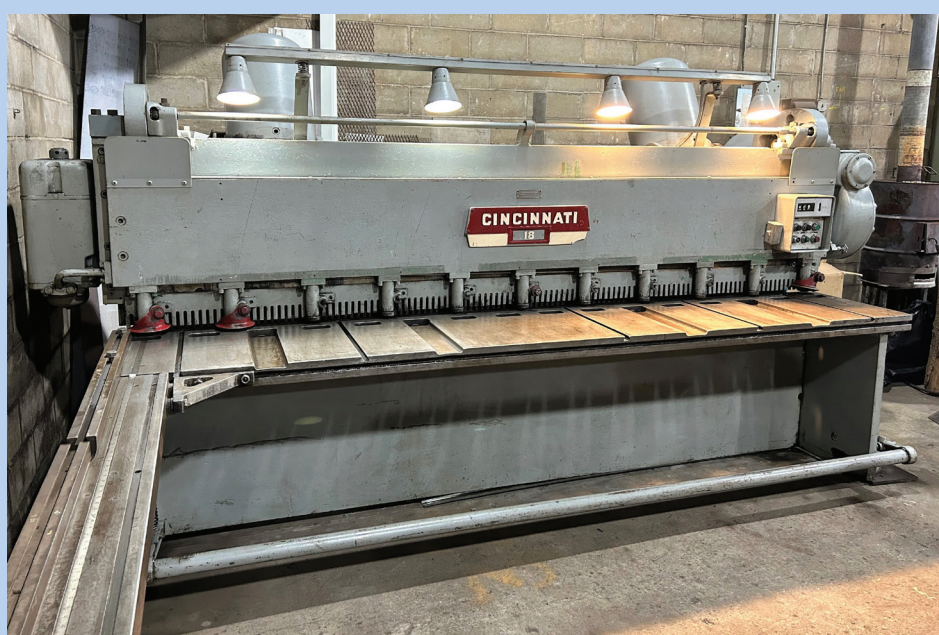
Cincinnati Model 1810 10' x 1/4" Squaring Shear